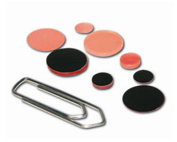
Fig. 1 Oxygen Sensor Spots PSt3 and PSt6

The chemical optical oxygen sensor spots can be attached to the inner surface of any transparent glass or plastic vessel like e. g. shake and spinner flasks, tubes, Petri dishes or cultivation bags. Oxygen is measured non-invasively and non-destructively through the transparent vessel wall. The oxygen sensor spots do not consume oxygen. They can be autoclaved and stand steam sterilization.