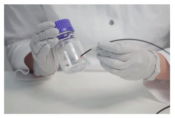
Fig. 11 Polymer optical fiber held by hand opposite the sensor spot to read its response

Then the vessel can be filled with your sample. Mount the respective accessory on the outer surface of the vessel right opposite the sensor spot and connect it via polymer optical fiber to the oxygen transmitter. Or, in order to do this manually, directly hold a polymer optical fiber to the outside vessel wall opposite the sensor spot.