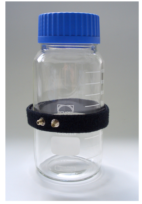
Fig. 4 Adapter for round containers (ARC)

If you have applied a sensor spot to a round vessel the adapter for round containers can be used. The ARC can be adjusted to different vessel sizes and holds the polymer optical fiber in place.