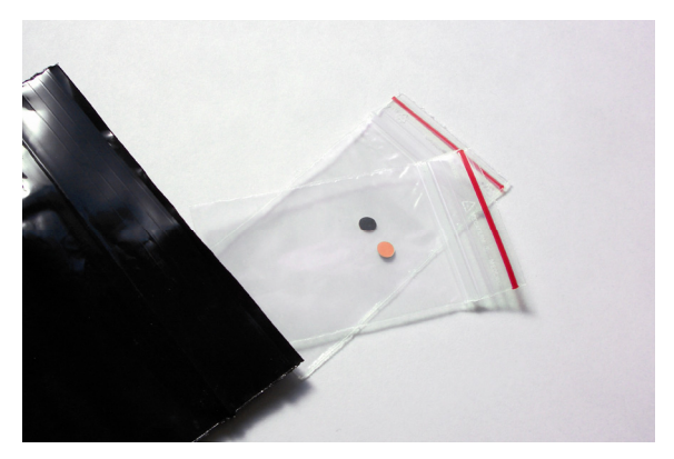
Fig. 6 Light tight package with individually packed sensor spots

The sensor spots are delivered in a light-tight package to ensure a long shelf-life, so do not open this packaging immediately at delivery. It is recommended to unpack the sensor spots just before using them. Carefully remove the sensor spots from the protective external cover. Each packing unit includes 1 (autoclavable) or 10 (not autoclavable) sensor spots packed individually in transparent plastic sachets.