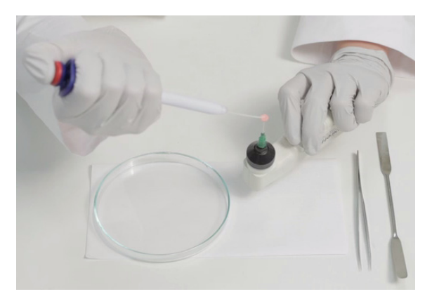
Fig. 9 Applying silicon glue to the sensor spot

Holding the sensor spot with the vacuum tweezers apply approx. 4 \mu L (when using spots with common diameter of 0.5 mm; otherwise please consider) of silicon glue on the red side of the sensor spot using a dispenser pipette.