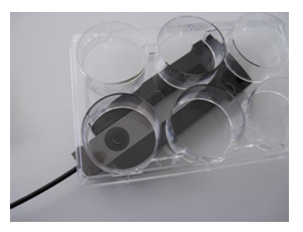
Fig. 5 Coaster CFG used to read the response of an oxygen sensor spot in a 6-well multidish

A coaster CFG connected to a fiber optic oxygen transmitter can also be used. Place the CFG under the vessel and make sure its optical module is right opposite the sensor spot.