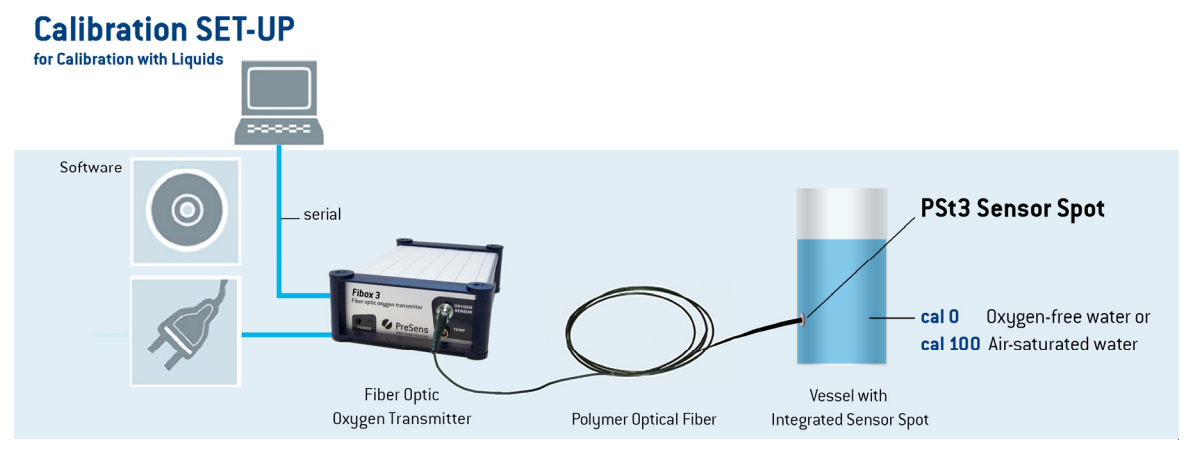
Fig. 12 Calibration set-up: Two-point calibration of a PSt3 sensor spot with liquid calibration standards

Then follow the instructions in the respective transmitter manual for calibration.