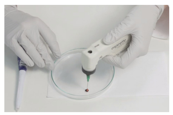
Fig. 10 Carefully place the oxygen sensor spot in the vessel

No air should be enclosed in the silicon glue between sensor spot and vessel wall. The glue should be spread evenly over the sensor spot surface to avoid detachment. Put the vessel in a dark place and let the silicon glue cure for at least 12 hours.